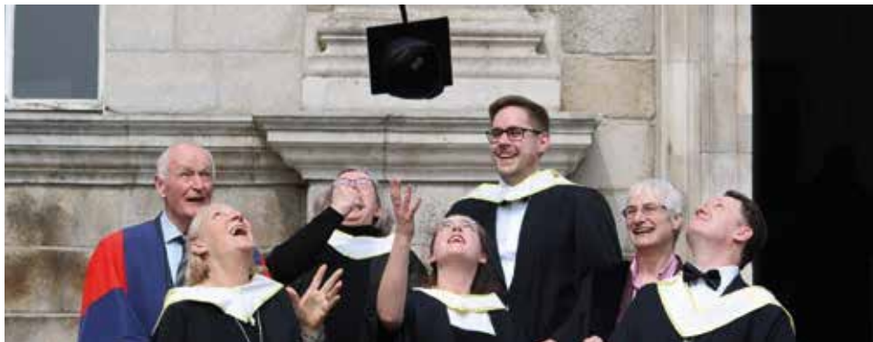
MPhil students celebrate at their graduation (Class of 2018/19)

This Masters in Christian Theology will enable participants to gain an in-depth knowledge of core issues in contemporary Christian theology. Students are introduced to historical scholarship and to rigorous contemporary theological investigation. A written dissertation is a key part of the MPhil.